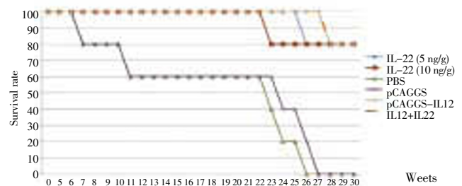
Figure 1. Survival rate of the mice that received IL-12, IL-22, and IL-12+IL-22 in comparison with the control groups during the 30 weeks of evaluation after the challenge with 2 \times 10^6 promastigotes of L. major .

The mortality rates for PBS and pCAGGS control groups were 100% in weeks 26 and 27 after the challenge with L. major . This is while at this point, the survival rates for IL-12, IL-12+IL-22, and IL-22-5 ng/g groups were 100%. The survival rate of 80% for IL-12 and IL-12+IL-22 groups was observed at week 28, while this was observed at week 26 for the IL-22-5 ng/g group (Figure 1).