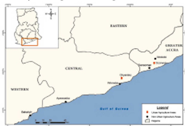
Figure 1. Map of Ghana showing sites where mosquitoes were collected for the insecticide susceptibility test.

Mosquito larvae were collected from ponds, polluted drains, choked gutters and rice fields from seven localities in southern Ghana. Collection sites were selected from different settings (Figure 1); urban and peri-urban, urban agricultural and commercial. Larvae were brought to the laboratory for emergence and testing of adults.