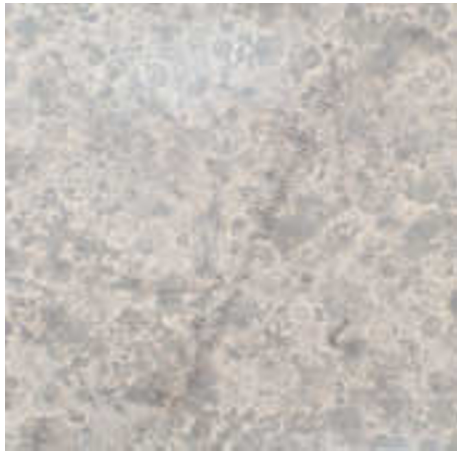
Figure 1. Blastocystis cells grown in Blastocystis egg medium. A drop of culture suspension was observed at 40× magnification.

cultures. Figure 2 shows the detection of representative PCR amplicons via agarose gel electrophoresis from stool and culture DNA, respectively.