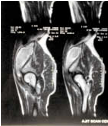
Figure 1. MRI of Hip Joint showing presence of haematoma in the left iliac fossa extending up to iliopsoas insertion in the lesser trochanter.