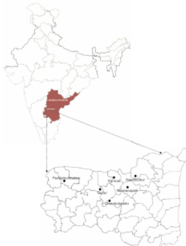
Figure 1. Map of Kurnool district showing location of study areas.