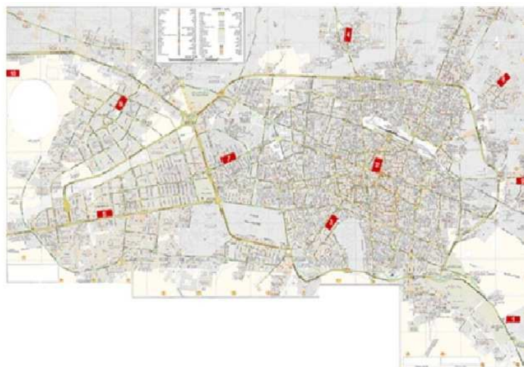
Fig.1. Mashhad air pollution monitoring station sites