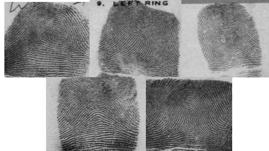
Figure 5. Five classes of fingerprints

fingerprint images, it is essential to incorporate a fingerprint enhancement algorithm in the minutiae extraction module.