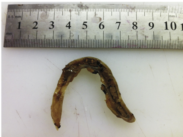
Figure 2. Appendectomy material within a fecaloma.

His complaints was totally resolved postoperatively and discharged on the fourth postoperative day.