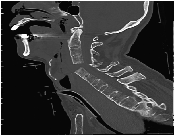
Figure 1. We noticed the extension fracture between the fourth and fifth cervical spine. Besides, the neck collar and the cricothyrotomy tube were also revealed.