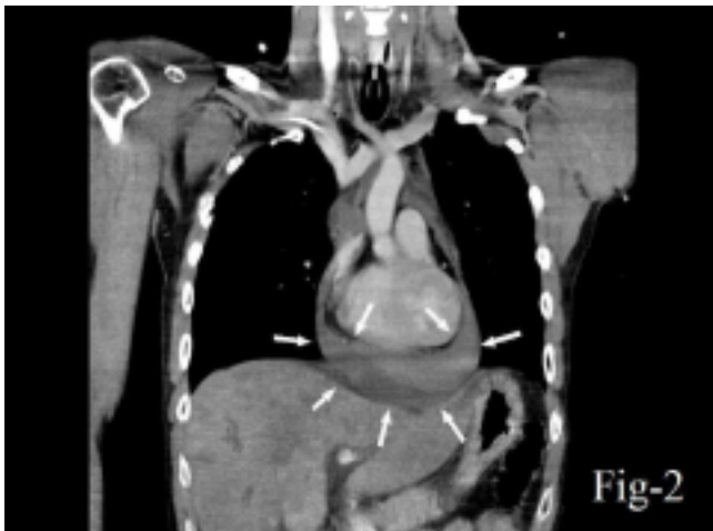
Figure 2. There was massive pericardial effusion with cardiac tamponade seen (white arrow keys).