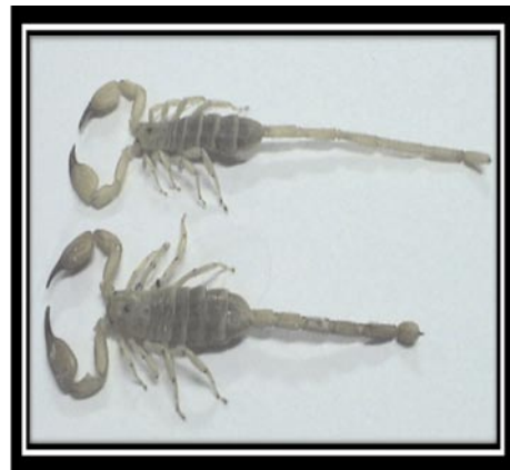
Figure 3. A photo illustration of male and female H. lepturus (Prepared by MH Pipelzadeh et al).

As far as we know, no study exists to survey the situation of scorpionism in Gotvand County, Khuzestan province, Iran. This study was conducted to determine the epidemiology of scorpion stings in this region. These data are important for the control of stinging by scorpions.