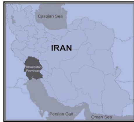
Figure 2. Map of IRAN Provinces, the Khuzestan Province displayed in black color (Prepared by National Geosciences Database of IRAN).