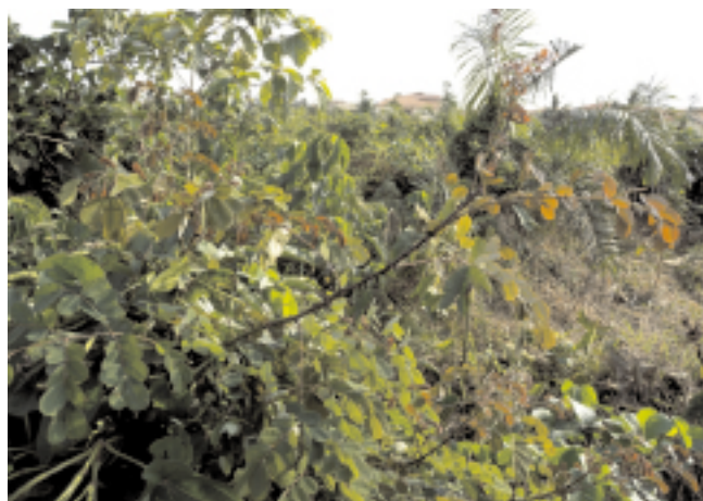
Figure 1. M. benthamianum .

The presence of some peptides, unsaturated long chain aldehydes, alkaloidal constituents, essential oils, flavonoids, saponins and tannins have been confirmed in M. benthamianum [21,22] , therefore this plant is worthy to be studied for its anti- candidal and antioxidant properties, since documented studies on the antifungal activities of the plant are scanty to the best of the authors' knowledge. Methyl gallate and gallic acid has been identified as the