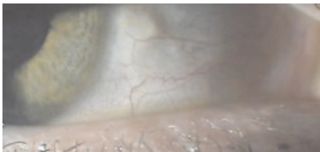
Figure 2. Thin tear meniscus.