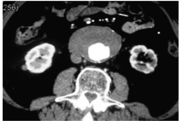
Figure 1. CT angiography showing an infrarenal aortic aneurysm, 8 cm in diameter.

The intraoperative period was uneventful with no apparent difficulty in the deployment of the main body and the catheterization of the contralateral limb. The final angiogram