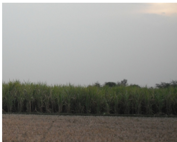
Fig 4: Sugarcane field in the village of Villupuram district.