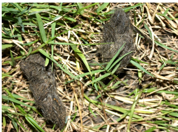
Fig 2: Fecal matter had seen from agrestic domain

In the agrestic domain granger said about the fox's marks and relative fugacity in cultivation farms. Such as a foot mark of foxes, hairs felled, fecal matter (Fig.2.) etc., it was in culturing time they had seen the marks. This relative fugacity 30-50% granger' people had seen.