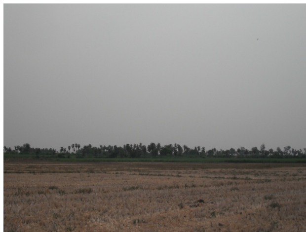
Fig 3: Cultivated paddy field in the village of Villupuram district

Prey availability obtains in agrestic domain as rats, craps, insects etc., these prey availability in cultivation domain for fox feed. Sometimes it may occur in sugarcane domain and it does eat white sugarcane. These are all the things of agrestic granger identical about the fox feed available in the agrestic domains. Likewise rainy time it had feed the snails in side of water channel. Fox survives of agrestic domain in villages of villupuram district (Fig.3 and Fig.4).