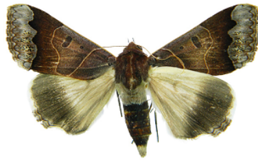
Anua mejanesi (Guenee)