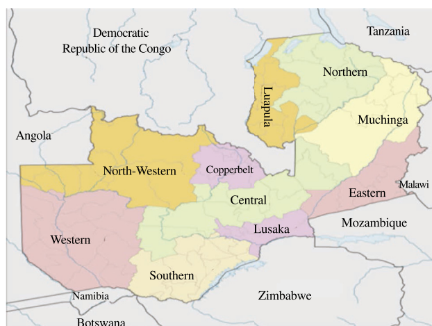
Figure 1. Map of Zambia showing provinces.

In this regard, the focus of the IPTp analyses was on pregnant woman who should have taken at least two or more doses of sulfadoxine–pyrimethamine antimalarial medicine during antenatal care visits, as directly observed therapy, starting in the second trimester of pregnancy [18]. Trend analyses on women, who received at least two doses of IPTp, were carried out using the Chi -squared test, at 5% level, to confirm any significant difference in trends. The uptake of IPTp was compared between rural and urban, education level and wealth index. The classification into rural and urban was based on an analysis by the Department for International Development of the United Kingdom, which takes into account several parameters, including access to basic services-health, education (and other social services) and population density [19]. Figure 2 shows the distribution of the general population by province in Zambia [Data for Muchinga Province was unavailable]. Education was classified into four levels: none, primary, secondary and college, and the first level of education was used to compare uptake with the other education levels. Wealth index was calculated based on the demographic and health survey definition [20]. We then generated three levels: low, medium and high wealth status. In all comparison, the Chi -square was used. Furthermore, a multiple logistic regression of IPTp uptake with year, rural/urban, education, wealth index and province as explanatory variables was fitted.