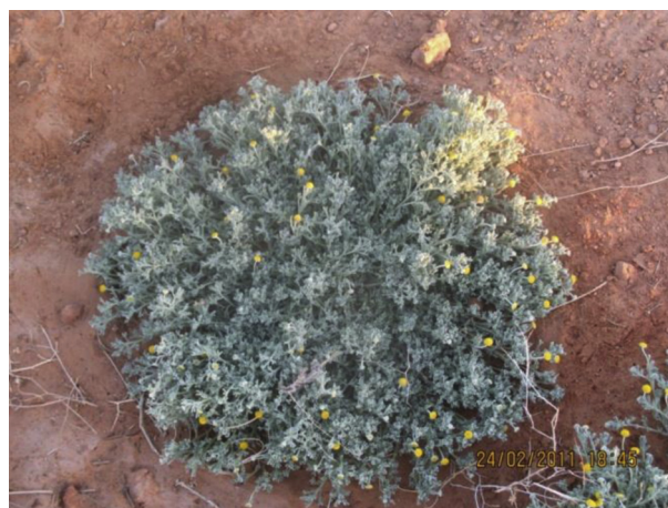
Figure 1. Photograph of C. cinerea taken at the time of collection.

The species C. cinerea , with synonym of Brocchia cinerea [5], is a small woolly whitish plant, with thick leaf divided in