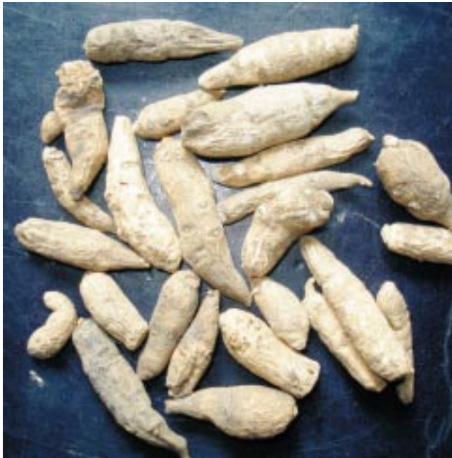
Figure 1. Rhizomes of A. heterophyllum .

was found to be 8.75 mg/g equivalent to gallic acid while total tannin content was estimated to be 19.254 mg/g equivalent to tannic acid. The total flavonoid and flavonol content evaluated were reported to be 3.125 and 0.963 mg/g equivalent to rutin. Total alkaloid and saponin estimated in the plant material were reported to be 2.556% w/w and 6.484 mg/g equivalent to diosgenin.