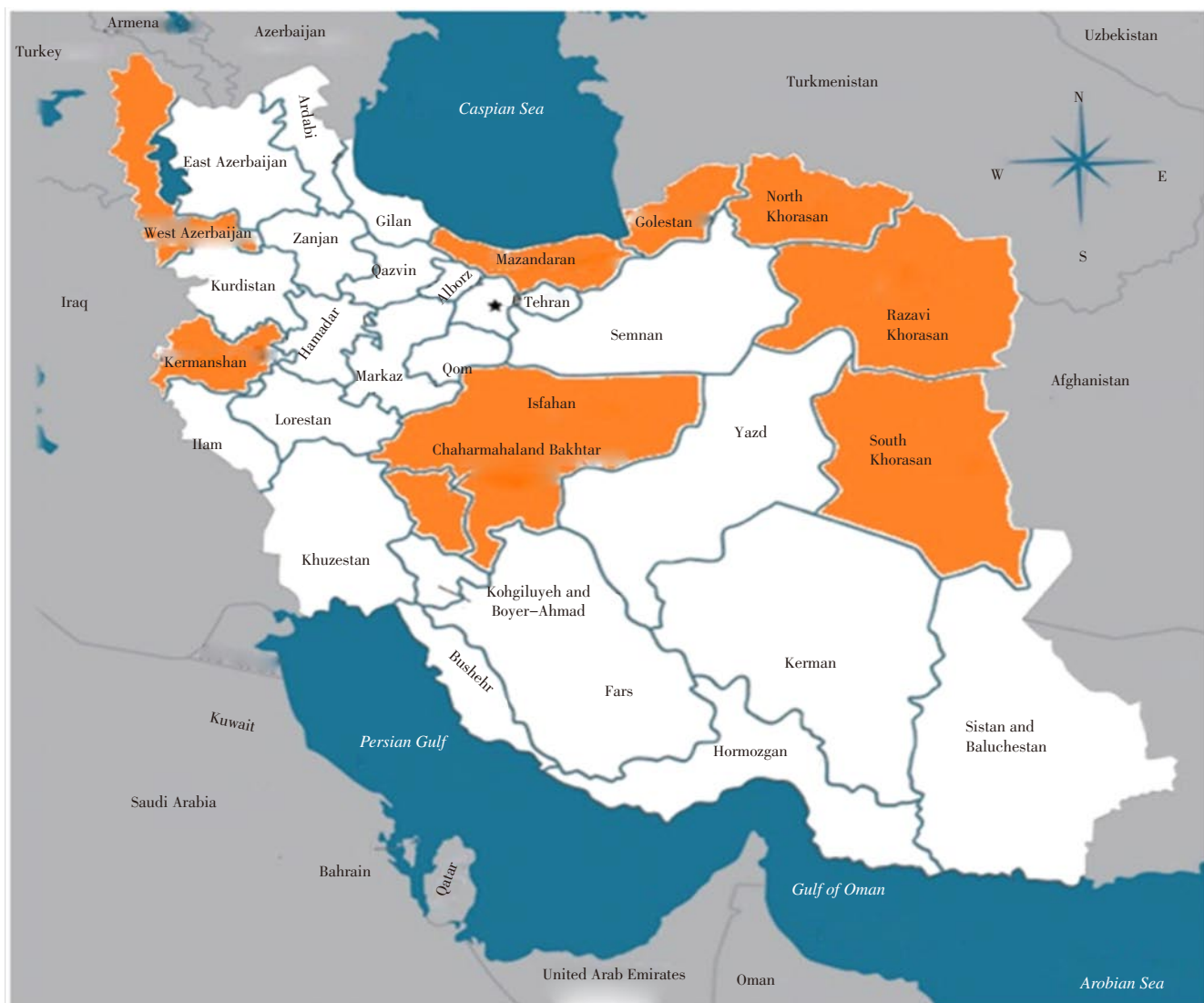
Figure 1. Map of Iran-sampling regions.

For the histopathological study, brain tissues of aborted fetuses