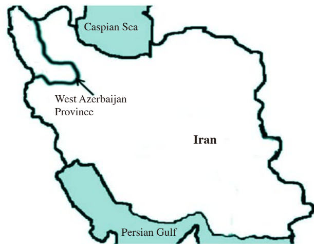
Figure 1. The map of Iran and location of West Azarbaijan Province.

Larvae collection was carried out from different habitats using the standard (350 mL dipper) dipping method in 7 localities of three counties across West Azarbaijan Province (Figure 1)[19].