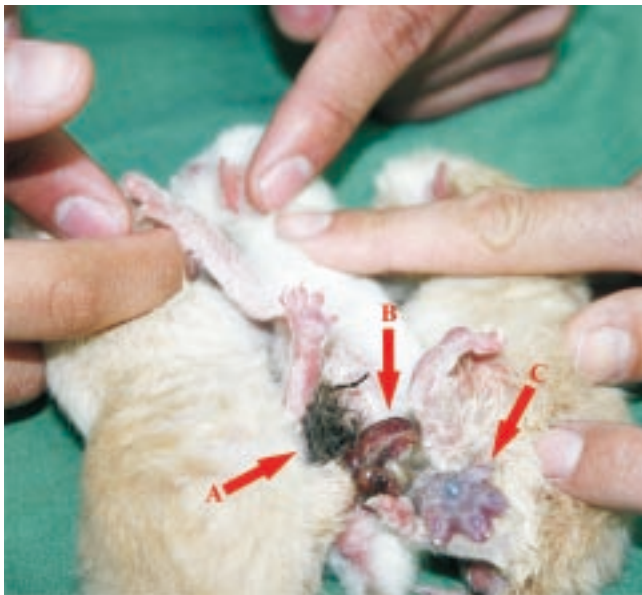
Figure 1. The moms' hairs entangled with umbilical cord of 3 kittens. A: Umbilical cords twisted around together; B: This complex haing been warped around the left tarsus of one of the involved kittens; C: Soft tissue swelling and edema observed in distal limb.

A 3-year old Persian queen was referred to Teaching Veterinary Hospital of Shahaid Bahaonar University of Kerman while 3 neonates' umbilical cords being entangled with the queen's tail hair. The queen had a normal parturition and delivered 4 neonates, 12 hours before the referring. Close inspection of the cat showed that the umbilical cord of 3 kittens have twisted around together and entangled with the moms' hairs in the base of tail region. Also this complex has been warped around the left tarsus of one of the involved kittens. Because of vascular obstruction in distal extremity of the involved hind limb, swelling and skin darkness were obvious (Figure 1 and 2A). In clinical examination, the queen and all kittens were alert and had normal clinical findings except the kitten with injured leg who was depressed.