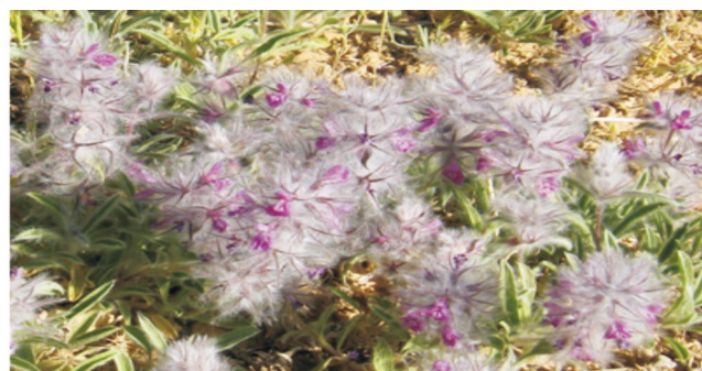
Figure 1. Aerial plant of S. lavandulifolia Vahl (Lamiaceae).

The inflorescences (0.05–0.10 kg) of wild populations of S. lavandulifolia Vahl were collected at the early flowering stage on 1–20 June 2010 (During 20 day's period). The samples of the plants were identified by regional floras and authors with floristic and taxonomic references[3], and voucher specimens were deposited at the Herbarium of Agriculture and Natural Resources Researches Centre of Chaharmahal va Bakhtiari province, Iran (No.: SHK 2164) (Figure 1). Harvested inflorescence was shade dried at room temperature for one week and ground into a powder. Air-dried and ground (50 mesh) plant material was subjected to hydro-distillation (1 000 mL distilled water) for 2 h using a Clevenger-type apparatus according to the method recommended in British pharmacopoeia[29]. Samples were dried with anhydrous sodium sulphate and kept in amber vials at 4 °C until chromatographic analysis.