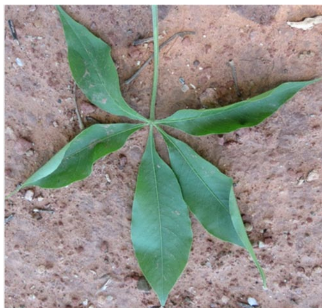
Figure 2. Leaf of A. digitata .

Leaves are 2-3-foliolate at the start of the season and they are early deciduous, of which more mature ones are 5-7(-9)-foliate. Leaves are alternate at the ends of branches or occur on short spurs on the trunk. Leaves of young trees are often simple. Leaflets are sessile to shortly petiolulate with great variation in size. Overall mature leaf size may reach a diameter of 20 cm and the medial leaflet can be 5-15 × 2-7 cm, leaflet elliptic to ovate-elliptic with acuminate apex and decurrent base. Margins are entire and leaves are stellate-pubescent beneath when young becoming glabrescent or glabrous. Stipules are early caducous, subulate or narrowly triangular, 2-5mm long, glabrous except for ciliate margins(Figure 2)[16].