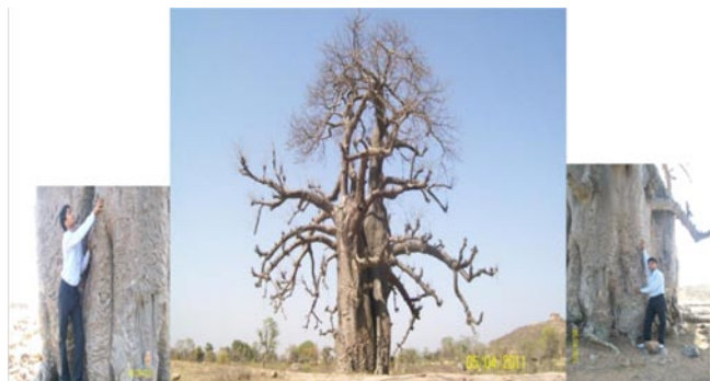
Figure 1. The A. digitata in central part of India, region of Bundelkhand (Orchha, Madhya Pradesh, India).

The baobab tree (Figure 1), and its related species belong to the family of Malvaceae and the genus Adansonia . The tribe, which is pantropical, includes Bombax and Ceiba producing fruit fibres used as kapok. The family includes about 30 genera, 6 tribes and about 250 species[2]. A number of these species are used locally for leaves, wood, fruits, seeds or gum. The African baobab ( A. digitata ) occurs naturally in most countries of Sahara as a scattered tree in the savannah, and is also present in human habitation. In the past, some ethnic groups in Mali such as the Dogon, Kagolo and Bambara used to take seedlings from the wild to plant them around their villages[15]. The tree has been introduced in many countries used as an ornamental plant. It is also known as the dead-rat tree (from the appearance of the fruits), monkey-bread tree (the dry fruit as food for monkeys), upside-down tree (the bare branches looked like roots) and cream of tartar tree (the acidic taste of the fruits)[16].