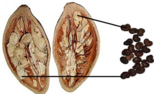
Figure 3. Fruit and seeds of A. digitata .

** : Ascorbic acid compared with oranges of 51 mg/100 g and calcium compared with milk of 125 mg/100 g[35].