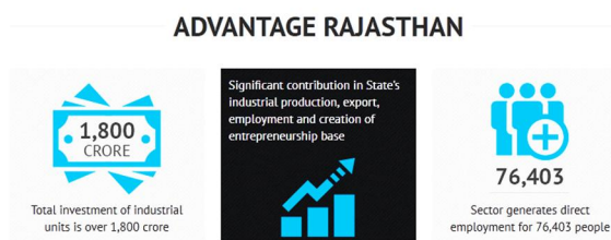
Fig. 2. Showing Focus on MSME in Resurgent Rajasthan