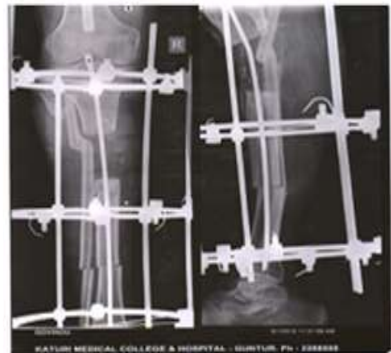
Fig. 2: Post-operative radiograph after sequestrectomy and distal corticotomy with ilizarov fixator