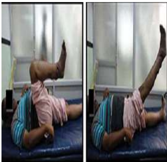
Fig. 5: Functional outcome at 10 months post OP