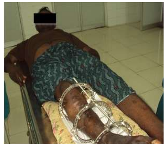
Fig. 3: Postoperative clinical photograph