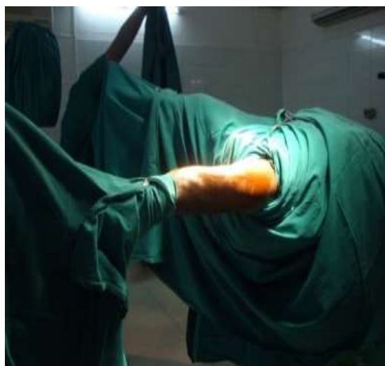
Fig.: Positioned in traction table

Latency period of 4 to 15 days was used rate of distraction was fixed at 1mm/day or sometimes altered depending on follow up x-rays. Follow up were done at monthly intervals. Frame removal done when the union was sound clinically and radiological lying confirmed. Fixator was dynamized before removal towards the end of the treatment. After removal patients were given functional brace for 6 weeks.