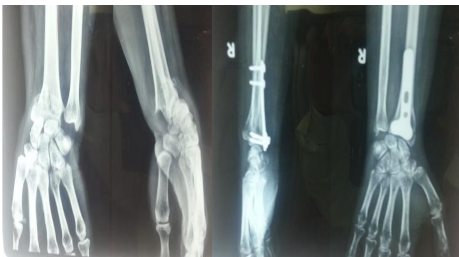
The hand was kept in ulnar deviation and slight flexion.

Volar fragment was reduced using indirect method of reduction by placing a towel beneath and that it self-provided with the traction pull required to reduce the fracture along with a 5mm osteotome under direct vision and a buttress plate was applied to the volar aspect. In few instances, the plate had to be bent about 10 degrees, volar ward tilting and a short arm splint was applied.