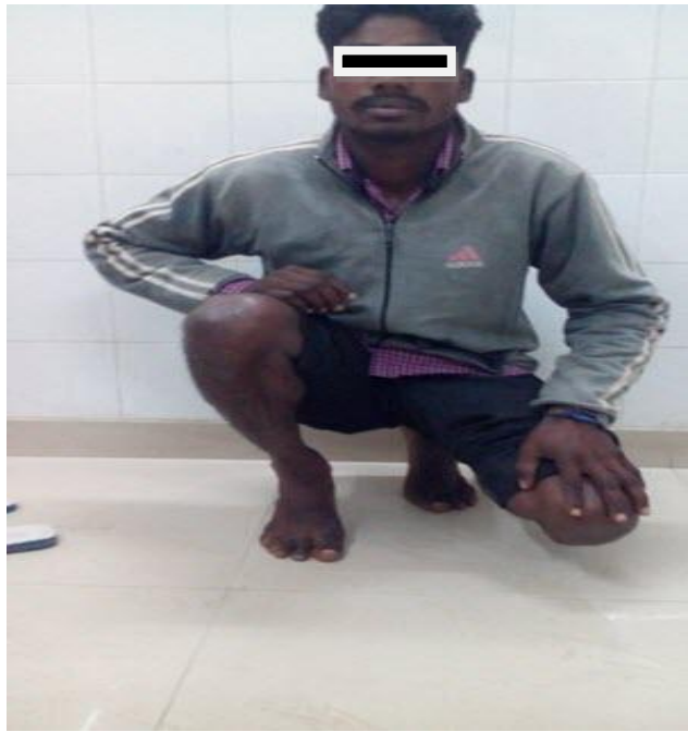
Fig. 1: Showing range of flexion

Closed nailing aims at avoiding periosteal stripping and maintain reduction while the fracture heals by peripheral callus bridging. Closed nailing is the most biological way of treating the fracture shaft tibia. Open reduction and internal fixation with plates and screws provide a rigid fixation and anatomical alignment. This method is an excellent method for the treatment of tibial malunionand non-union, as anatomical reduction is achieved and the fracture is sufficiently exposed so that bone ends may be freshened and bone graft added. This technique has an advantage over the intramedunary nailing in the patients who had external fixators, since it avoids the pin tracts (Wiss, 1986)<sup>8</sup>