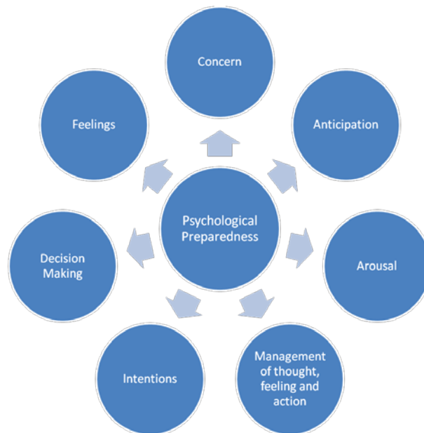
Psychological Preparedness and its seven facets

Management of thought feeling and action. These facets include person's cognitive, affective and temperamental aspects.