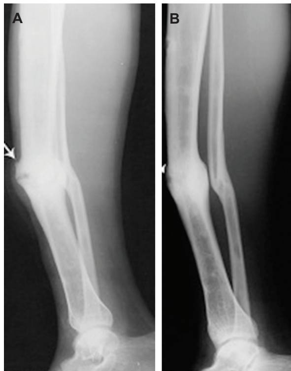
Fig.2: Lateral radiograph of a 32 years male non-united tibial fracture, arrow shows the fracture. A. Before intervention and B. 6 months after using MSCs in combination of platelet lysate product, arrow shows radiological signs of healing. MSCs; Mesenchymal stromal cells.