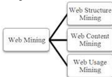
Fig. 2: Web Mining

Web Mining – It is the application of data mining techniques to discover patterns from the Web. According to analysis targets, web mining can be divided into three different types, which are Web usage mining, Web content mining and Web structure mining.