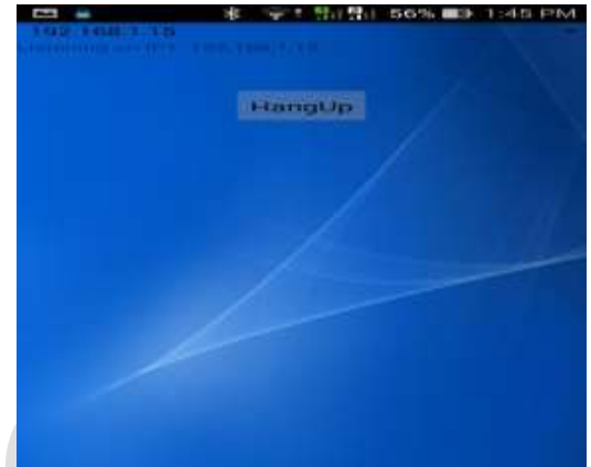
Voice Calling 2