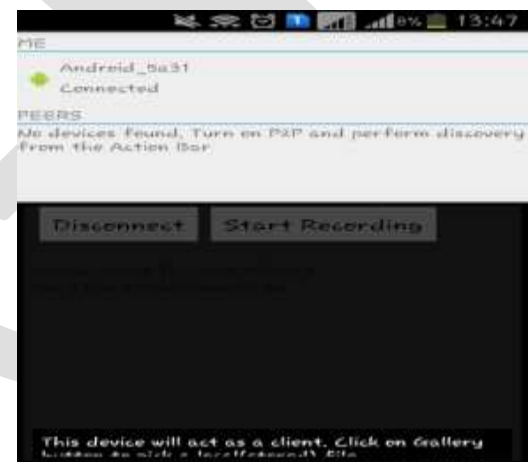
Recording Screen for Video transmission