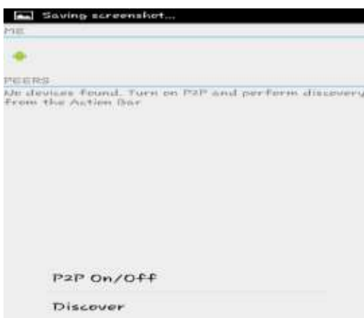
Searching devices for Video transmission