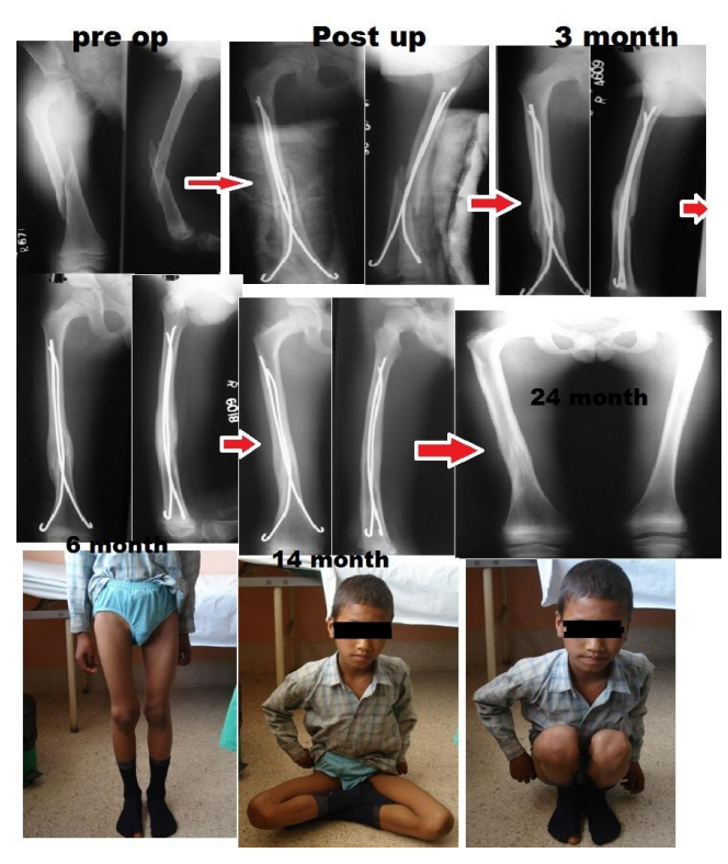
Figure 3: Radiological and Clinical evaluation outcome of Rush pin fixation.

In initial few comminuted fracture cases we applied posterior long leg plaster of Paris back slab toe-to-thigh (above knee) which we later discontinued till sutures were removed at 2 weeks. As soon as pain was tolerable, hip and knee range of motion with quadriceps muscle strengthening exercise was started and non weight bearing ambulation was allowed. Weight bearing was permitted once bridging callus is evident on X- ray on three cortices. Follow up was done at 6 weeks, 12 weeks, 6 months, 1year and 2 years for radiological and clinical evaluation (Figure 3).