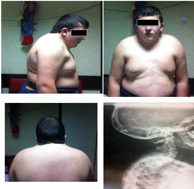
Figure 1: Case 1. A 15-years-old boy diagnosed at delivery with Klippel – Feil syndrome. Note the short neck, low hairline and symmetric shoulders. (Scar on the thorax after surgical repair of total anomalous venous return).

Despite being ventilated on 100 % oxygen, pulse oximetry could not be raised above 80 %. Hence, a prostaglandin infusion was commenced. Physical examination showed a short neck, low hairline at the back of the head, and particularly restricted mobility of the upper spine. Cardiovascular and respiratory examination was normal.