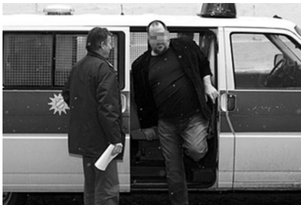
Figure 3: German sex offender Wolfgang Doffek found guilty in 2010 by the Passau District Court of multiple incidents of sexual abuse of children and sentenced to 6 years and 9 months in prison, and subsequent psychiatric confinement.

On January 8 th of 2010 the Landgericht (District Court) Passau found Doffek guilty of multiple incidents of sexual abuse of children and sentenced him to 6 years and 9 months in prison (Anonymous, 2010) (Figure 3). Because Doffek was considered a high-risk pedophile with likely recurrence and little chance of recovery, he was also sentenced to indefinite psychiatric internment. Not only the German jūdō world but the entire German sports world is shocked by the duration and extent of the abuse and several committees are formed to discuss and implement new measures to prevent such criminal behavior from reoccurring and from going on undetected (Laufer, 2011).