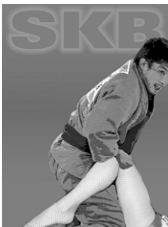
Figure 1: Poster featuring 2004 and 2008 double Olympic champion (-66 kg) Uchishiba Masato 内柴正人 in a compromising pose alluding to his arrest and subsequent conviction for rape of a female member of the Kyūshū University's jūdō team. The letters 'SKB' in the background refer to the Japanese word sukebei 助平 is Japanese and means 'lecher' or 'pervert'.

Improper touching in locker rooms, showers and saunas have also been reported. It is in this context that we have coined the term jūdō sukebei 柔道助平 [" jūdō lecher " or " jūdō pervert "]. The word sukebei 助平 is Japanese and means 'lecher' or 'pervert'. A jūdō sukebei , hence, is a person (male or female, though usually of the male gender) who under the pretense of engaging in jūdō and associated activities, seeks out situations to satisfy socially unacceptable sexual practices sexual desires, paraphilias or similar socially unacceptable sexual behaviors generally without the consent of the other(s), or, potentially involving minors (Figure 1).