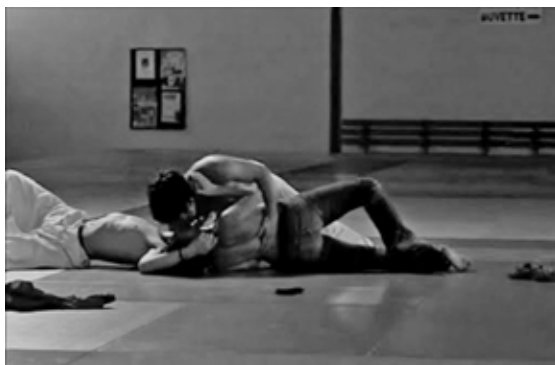
Figure 7: The infamous dōjō ménage-à-trois scene from the 2005 French jūdō movie Douches Froides [Cold Showers].