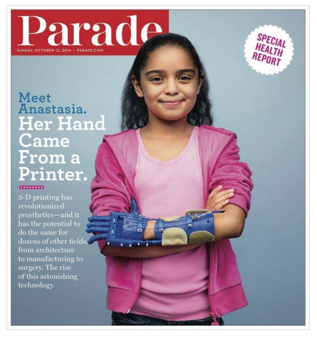
Fig. 4. Prospectives of 3D printer technology can be illustrated by its use in prosthetics, here on cover of October 12, 2014 issue of Parade.