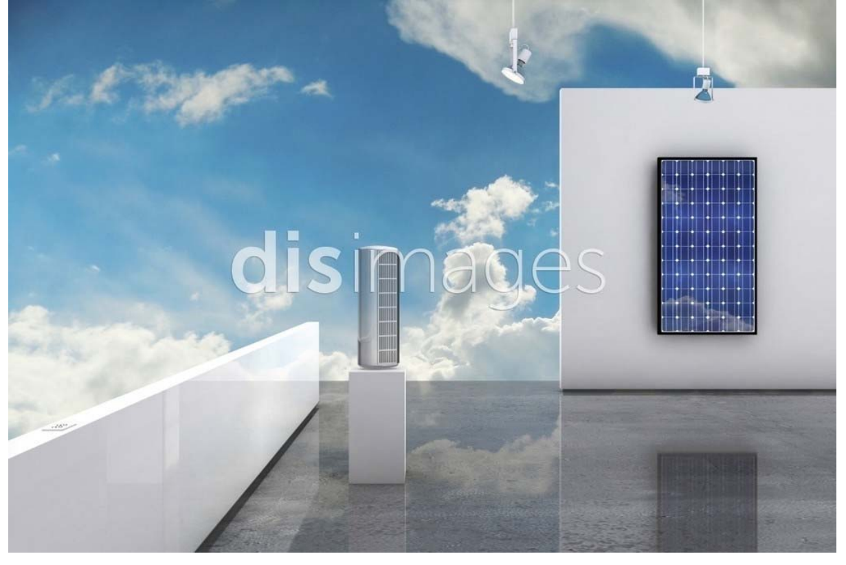
Fig. 2. DISimages may be used for art, exhibition, editorial, personal, or commercial use.

Thus though art and marketing are intuitively conceived of as mutually exclusive fields we are less assured of their contrast precisely because of their online presence. We can take elusive yet brutally actual Dismagazine<sup>1</sup> and their stock image database disimages as penultimate example of such trend. Although the encounter of those two spheres within postinternet is somehow self-evident, their subsequent theories are not and perhaps cannot catch the train of their rapid development. From the art related side we are flooded by intentionally fragmentarized views while marketing is satisfied with methodological self-affirmation. Here possible philosophical perspective comes in question.