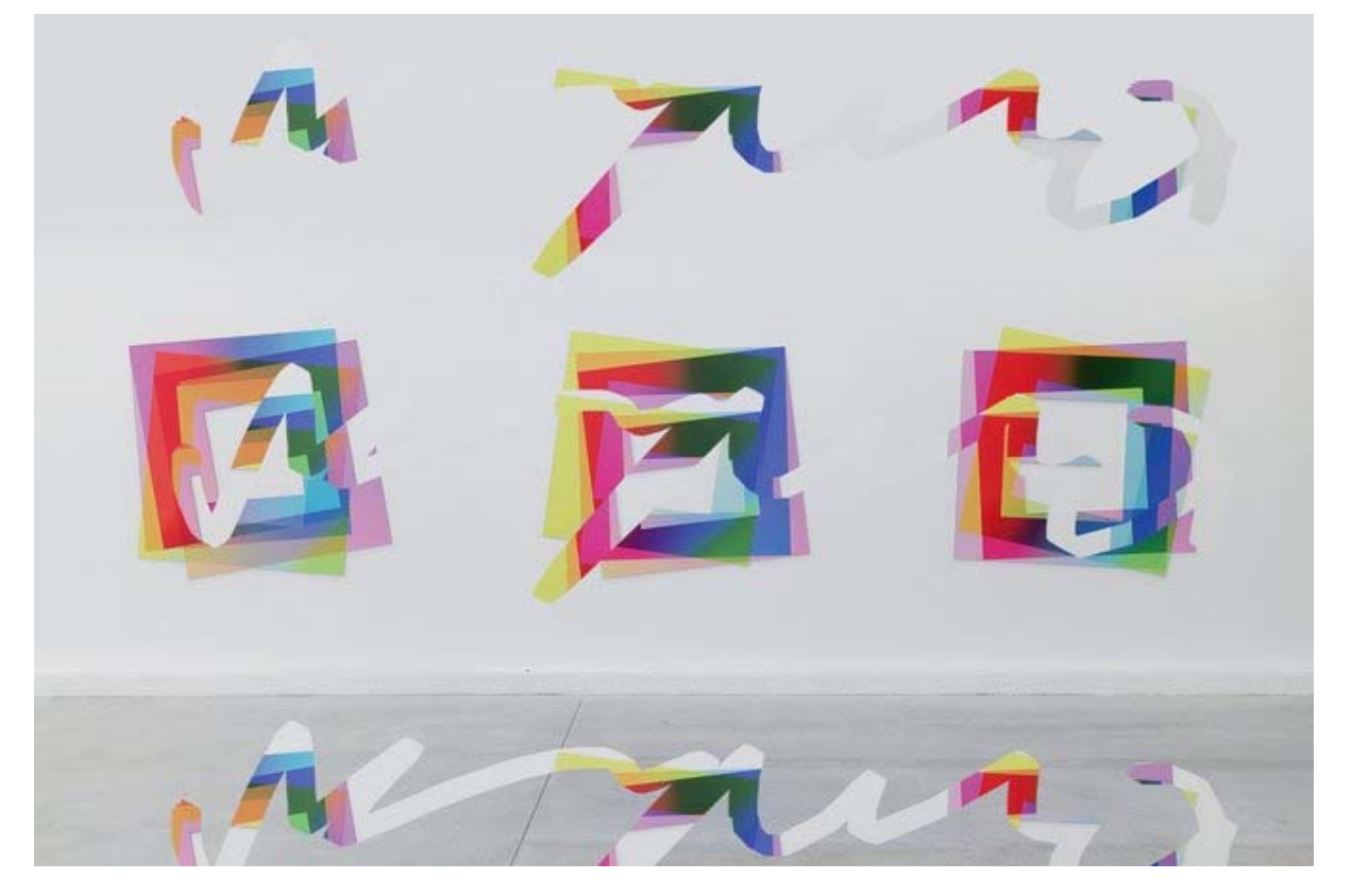
Fig. 1. Artie Vierkant, Image objects, 2011 ongoing. Source (Vierkant, 2011).

This is citation from interview (Debatty, 2008) with Marisa Olson.