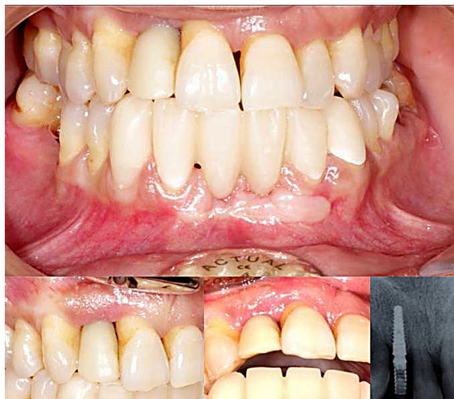
Fig. 5. Result on sixth month.

The reevaluation six months after the anti-infective periodontal therapy demonstrated a stable periodontal status. The subsequent implant and prosthetic treatment led to the restoration of a functional dentition (Fig. 5).