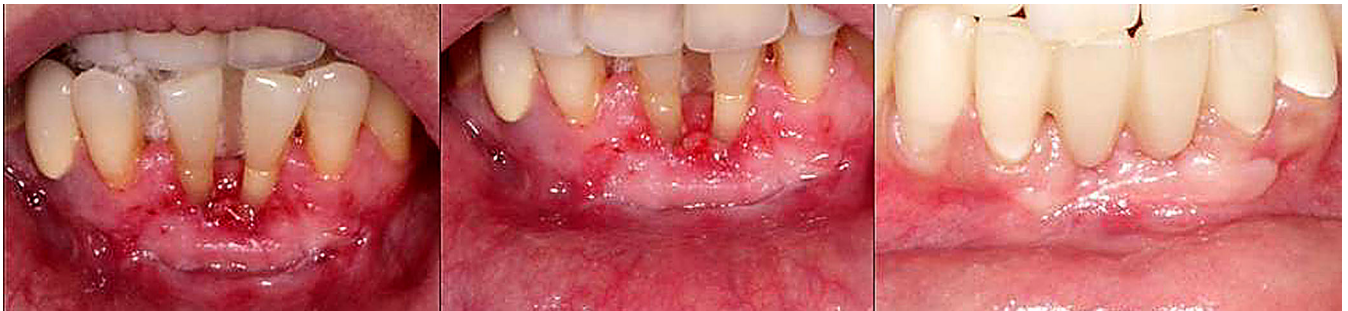
Fig. 2. Autogenous gingival graft.

Placement of 3,5/12 mm implant Natural + (Euroteknika) with immediate screw retained provisional restoration on temporary abutment. (Fig. 3)