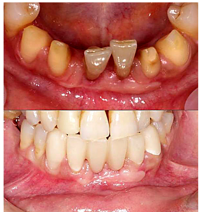
Fig. 4. Immediate provisional restoration in frontal mandibular region.

Extraction of the mandibular central incisors and placement of the immediate CAD-CAM fabricated provisional restoration with the correction of the cross-bite of the left lateral incisors. The “bullet shape” design of the provisional central incisors ensures the preservation of the interdental papilla's (Fig. 4).