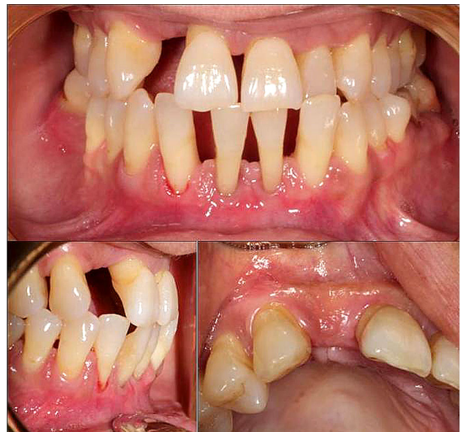
Fig. 1. Initial status.

S.S. (42) with a severe chronic periodontitis (HI 31%, PBI 2,13/66%, PD (0-3 mm) = 38%; PD (3-5 mm) = 54%; PD (5-7 mm) = 8%, CAL: 99%/4.5mm. In the lower mandibular segment an insufficient vestibule depth with a lack of keratinized gingiva and Miller class III gingival recessions are observed. Both central incisors had III grade mobility. Furthermore the right maxillary lateral incisor is missing and a crossbite is present on the left mandibular lateral incisor [Fig.1).