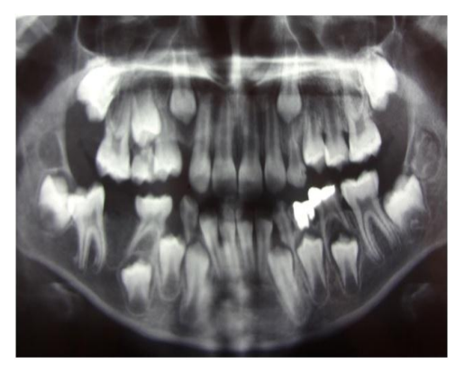
Fig 1-A. Initial panoramic view showed a well-defined mixed radiolucent lesion in the right mandible. The second deciduous molar was displaced forward and the first permanent molar was displaced backward.

A 10-year-Old Iranian girl was referred to the dentistry department with the chief complaint of failed eruption of the right permanent mandibular first molar. Physical examination showed a generally healthy child and the medical, surgical, familial and social histories were unremarkable. Intraoral examination revealed no expansion of the buccal or lingual cortical mandibular plate. The overlying mucosa was intact and normal in color and consistency. Radiographic examination by means of a panoramic radiography (Fig. 1-A) indicated a well defined multilocular radiolucent lesion in the right mandible. The second deciduous molar was displaced forward and the first permanent molar was displaced backward. But the periodontal ligament of both teeth was intact. The periapical radiography of the area showed the same mixed radiolucent lesion (Fig.1-B).