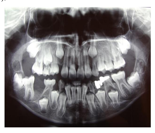
Fig 1-C. a panoramic view after surgery. The lesion was totally removed

Based on clinical and radiographic findings, a presumptive preoperative diagnosis of ameloblastoma or odontogenic cyst was made. Under local anesthesia, the lesion was totally removed through an intraoral approach (Fig.1-C). The enucleated material was sent to the Oral & maxillofacial Pathology Department of the Dentistry School of Isfahan University of Medical Science for histological diagnosis. Microscopically, neoplastic proliferation of odontogenic epithelium consisted of cords and islands was seen; (Fig. 2-A). Histopathologic view revealed double layer of cuboidal or columnar cells in a cell-rich mesenchymal stroma with plump stellate and ovoid cells and little collagens closely resembling the primitive dental papilla (Fig.2-B). Evidence of hard tissue formation in the sample was not observed, so the histopathological diagnosis was considered as ameloblastic fibroma. After 24-month follow-up, no recurrence was observed. The first molar was spontaneously aligned and the patient won't need any comprehensive orthodontic treatment (Fig. 3).