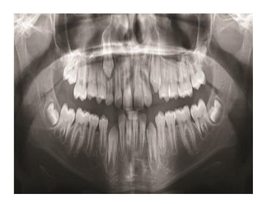
Fig 3. After 24-month follow-up, no recurrence was observed. The first molar was spontaneously aligned and the patient won't need any comprehensive orthodontic treatment

The recommendations of Helsinki declaration were thoroughly maintained during this study. Ethical approval of this article was confirmed by the ethics committee of Isfahan University of Medical sciences.