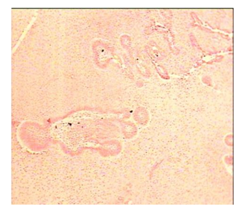
Fig 2-A. Microscopically, neoplastic proliferation of odontogenic epitheium consisted of cords and islands were seen