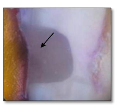
Figure 1. Illustration of specimen with no leakage (Score0)

* The level of significance was considered at p<0.05