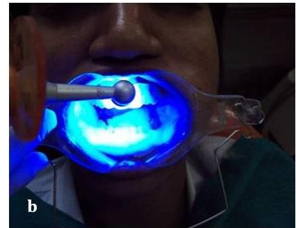
Fig. 5: (b)