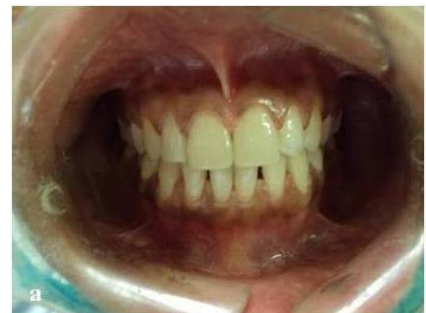
Fig. 6: (a)