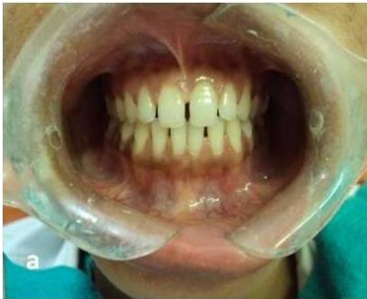
Fig - 1(a)

Closure of midline diastema and overall smile build up using a customized matrix technique.