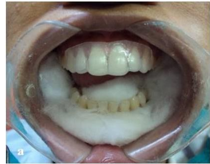
Fig. 5: (a)