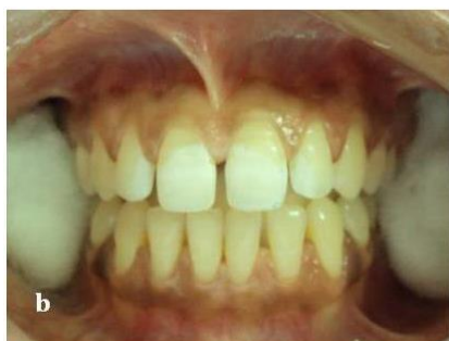
Fig. 4: (b)