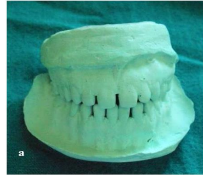
Fig - 2(a)

Impressions were made and models prepared. A diagnostic wax up of the models was performed to modify and finish them to predictable esthetics for the patient (fig.2a-b). The waxed up modified models were then duplicated. The duplicated casts were then placed in a Biostar machine. The matrix material selected was copyplast 1 mm (Scheu Dental GmbH Am Burgberg 2058642 Iserlohn Germany). Copyplast is a low density polyethylene (PE-LD) biocompatible material available in 1mm and 1.5mm round and 0.5mm, 1mm, and 1.5mm square. Copyplast is ideal for fabricating a temporary matrix. The matrix was fabricated and trimmed to be used in the patient's mouth (fig.3a-b).