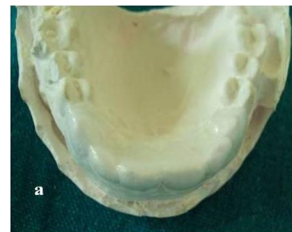
Fig - 3(a)