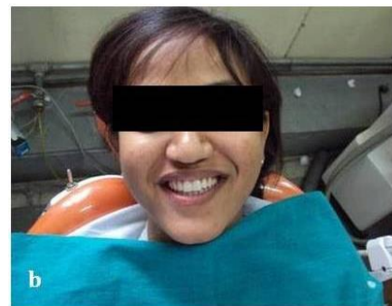
Fig. 6: (b)