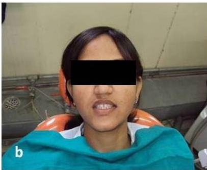
Fig - 1(b)