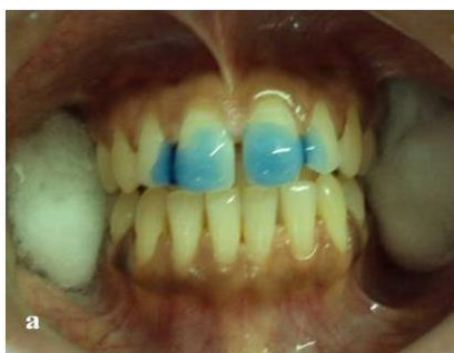
Fig. 4: (a)

In the process of resin build up after etching and bonding, a light-curing, radiopaque nano-hybrid restorative composite ( Tetric N-Ceram , Ivoclar Vivadent AG Schaan/Liechtenstein) was applied on the tooth surfaces and then the transparent custom matrix was placed. The curing was done with a light emitting diode (LED) curing unit (ART-L3 LED, Bonart Medical Technology, Inc. CA, USA) through the transparent matrix for 60 seconds for each tooth (fig.5a-b). After the curing was complete the matrix was removed and the extra flash was removed with fine-grit flame shaped diamonds and finishing carbide burs. The final finishing of the restorations was done by fine composite finishing discs (Shofu, Inc. Japan). The final restorations resulted in the diastema closure and as well as overall aesthetic improvement of the patient, both meeting the patient's expectations (fig.6a-b).