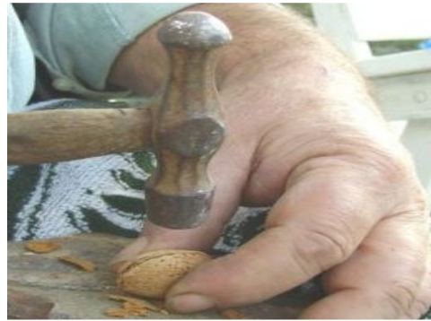
Fig no 2.1 De-husking and De-selling by manually

According to survey demand is high on that and other consideration we decide to this project.