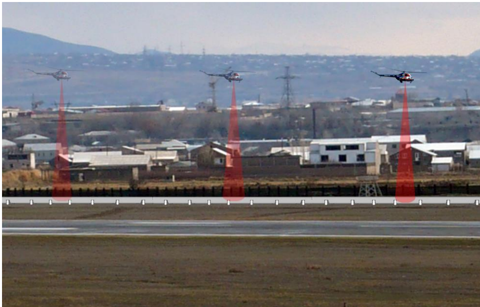
Fig4. Helicopter IR scanning of GMPs.

In the presence of fire hearths the radiation temperature in this region (within the wavelength range of 2.5 to 5.5 \mu\text{m} ) considerably increases that is registered by the electronic control unit.