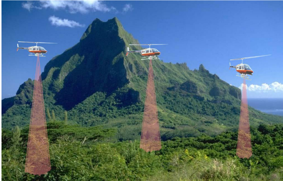
Fig3. Helicopter IR scanning of large forests.

In the presence of fire hearths the radiation temperature in this region (within the wavelength range of 2.5 to 5.5 \mu\text{m} ) considerably increases that is registered by the electronic control unit.