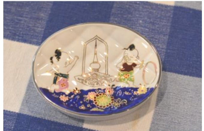
Figure 5. Adapted Benjarong soap dish