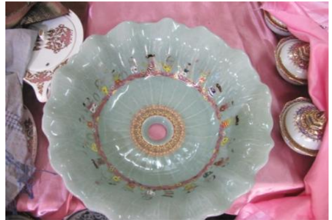
Figure 3. Adapted Benjarong washbasin

The new Benjarong washbasin could be produced for 1,500 baht and sold at 3,500 baht, generating 2,000 baht profit. The second items to be developed were wall tiles (Table 2; Figure 4).