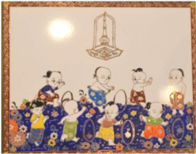
Figure 4. Adapted Benjarong wall tile