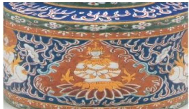
Figure 2. Norasingha and Teppanom patterns

The production conditions of Benjarong cause problems. There are many hurdles in the production process, such as the lack of style, variety and product benefits. Filigrees used are very delicate, making it difficult for the new generation of artisans to master