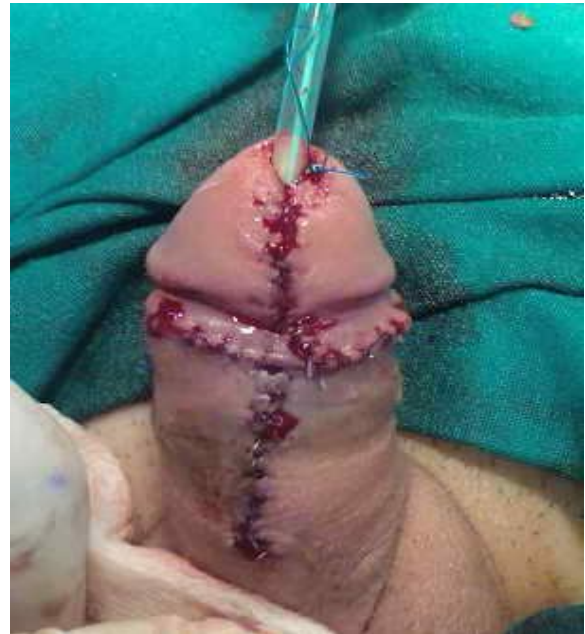
Fig. 2. Appearance after surgery.

A TIP urethroplasty technique was performed using magnification loupes, needle tip cautery, and 6–7/0 polyglactin absorbable sutures (Fig. 2). The silicone stent was removed 7 days after surgery.