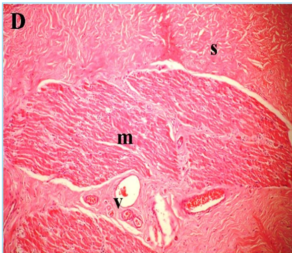
Fig. 1 A,B,C,D. Testicular mass composed of fibrocollagen stroma (s), irregular muscle bundles (m), vessels (v) and adiposus tissue (l) (A: H&E, X100; B: H&E, X40; C: H&E, X40; D: H&E,X100).