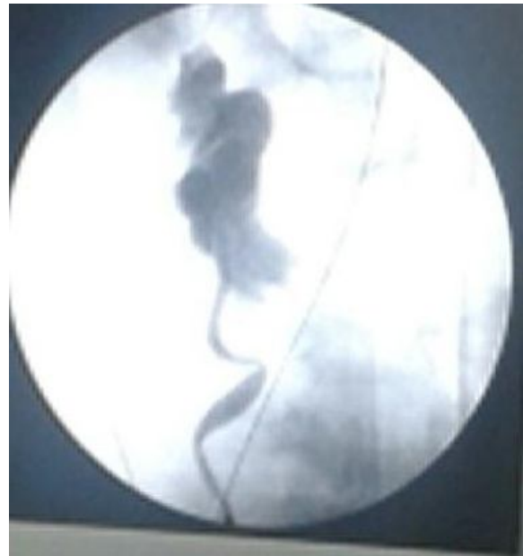
Fig. 3. Pre-operative right retrograde pyelography: A right retrograde pyelography was performed during the surgery but no pathology explaining the etiology of the right obstruction was seen. As we mentioned before, there was neither ureteral stone nor UPJ obstruction; therefore we concluded as rotational anomaly.

position and an incision of about 1 cm was made from the upper umbilicus edge. The peritoneal cavity was entered with a Veres needle. After making sure with the syringe that the peritoneum had been entered, a 10 mmHg pneumoperitoneum was created and a 10 mm trocar was placed.