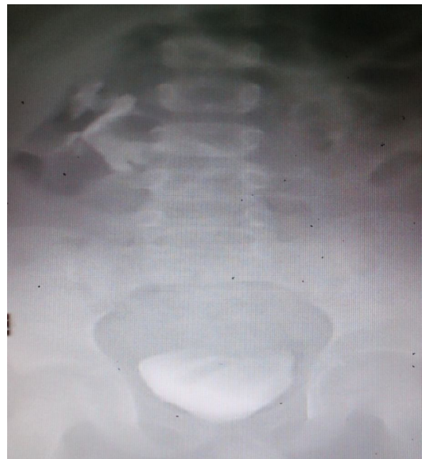
Fig. 1. IVP: Left kidney contours could not be selected on IVP and no contrast matter was seen in the left renal area. Grade 2 hydronephrosis plus blunt calyces were also seen in the right kidney.

abdominal pain and intermittent fever. Renal function tests, hemogram and urine culture results were normal. Magnetic resonance imaging (MRI) was taken at another center, the patient was admitted to us with MRI examination, and these images did not show the horseshoe kidney appropriately. The ultrasonography (US) was revealed a markedly hydronephrotic left kidney together with a thin renal parenchyma. The contrast uptake could not be seen in the left kidney. Therefore, the borders of the left kidney could not be distinguished intravenous pyelogram (IVP) in the inspection (Fig. 1).