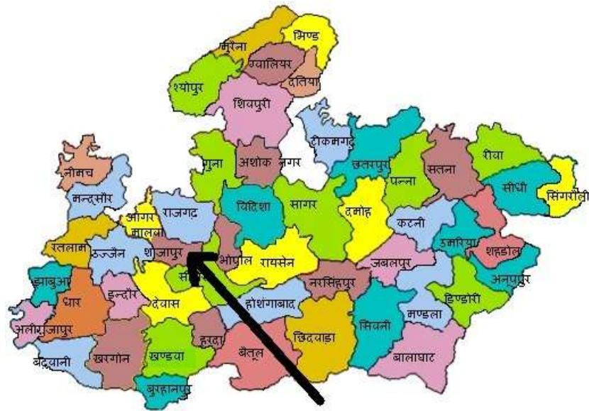
Figure 1: Madhya Pradesh Map