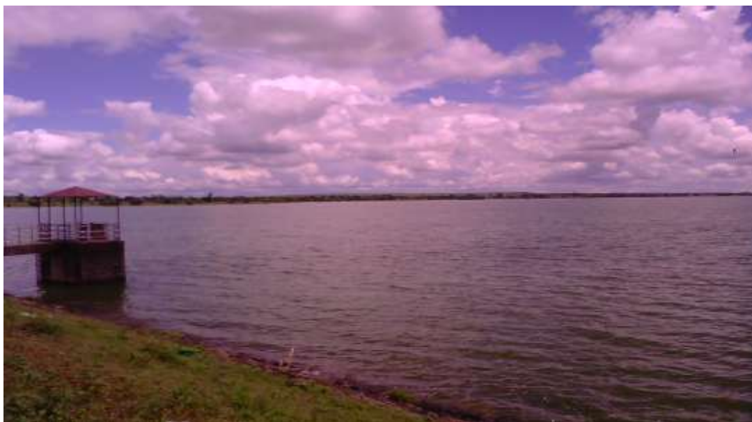
Figure 3: Real Photo of Chilar Dam