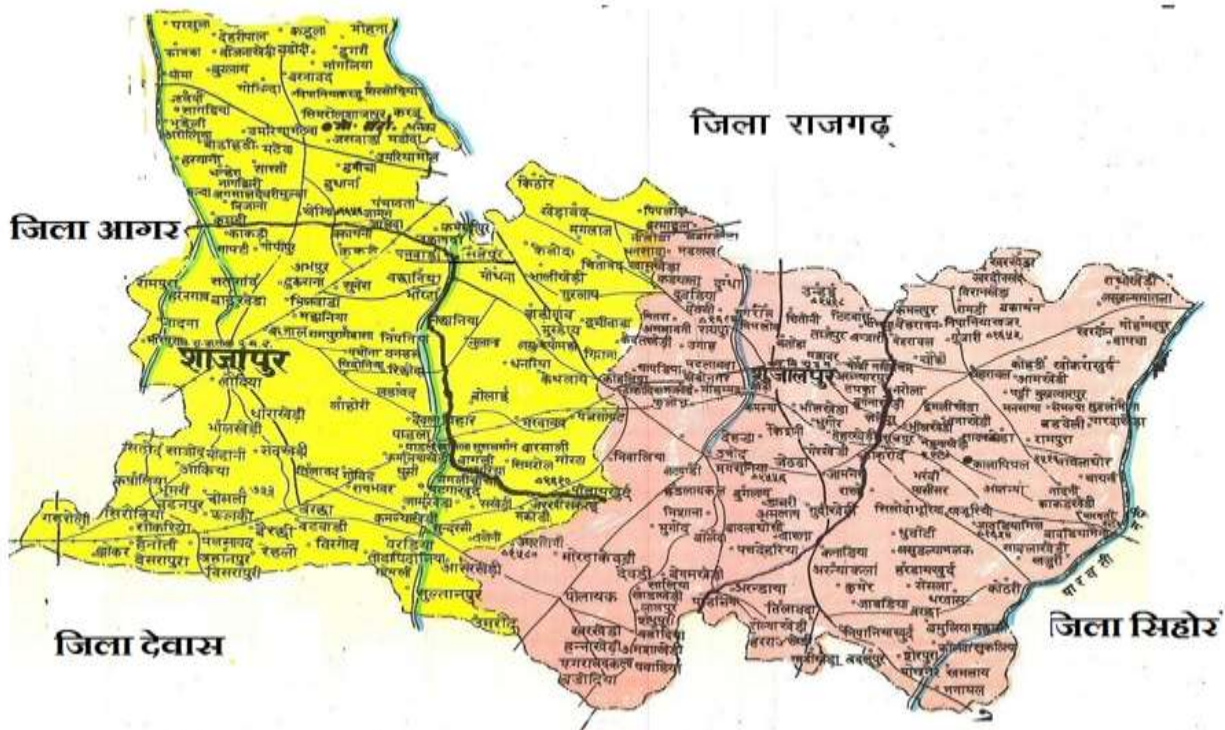
Figure 2: Shajapur Map