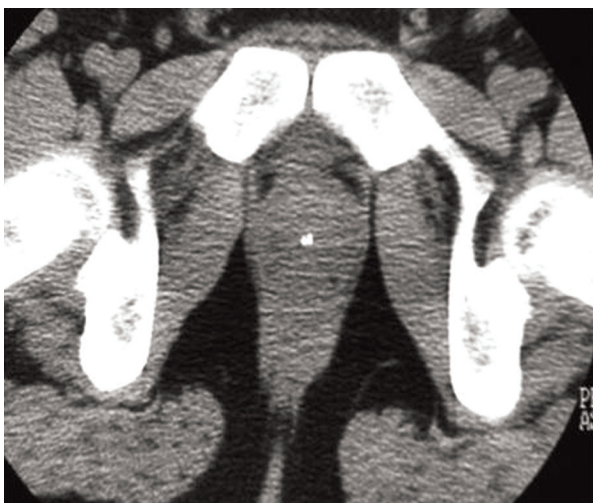
Fig.4: Pelvic HRCT: calcification in the prostate. HRCT; High resolution computerized tomography scan.