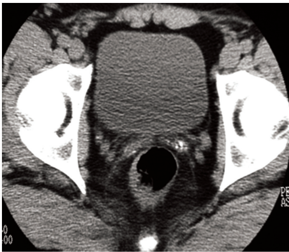
Fig.3: Pelvic HRCT: microliths in the seminal vesicles. HRCT; High resolution computerized tomography scan.

of hypofertility with a low volume of ejaculate (< 1 ml) and a sperm count ranging from 3 \times 10^6 to 15 \times 10^6 /ml, with low levels of fructose in the seminal plasma. Oligoasthenospermia and hypoposia due to distal obstruction of the seminal tract were diagnosed. Pelvic CT scans (Figs.3, 4) at the level of the seminal vesicles confirmed the ultrasonography (US) findings, demonstrating small radiopaque areas resembling the pulmonary microliths and a calcification in the prostate measuring 4 mm with a different appearance from the microliths. The patient gave an informed consent for the case report.