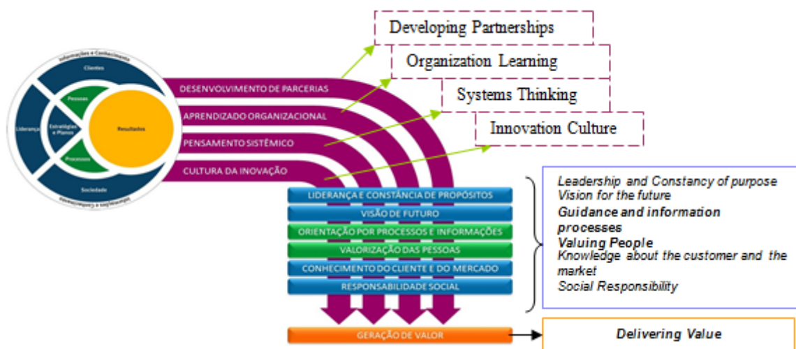
Figure 2: Adapted by Fundamentals of Management Excellence Model ® - MEG

The first seven criteria dealing with the management processes, the latter criterion is related to results obtained by the organization, as shown in Figure 2.