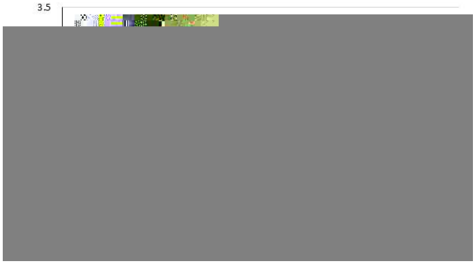
Figure 1. Effect of farmyard manure on mass frequency of aggregates